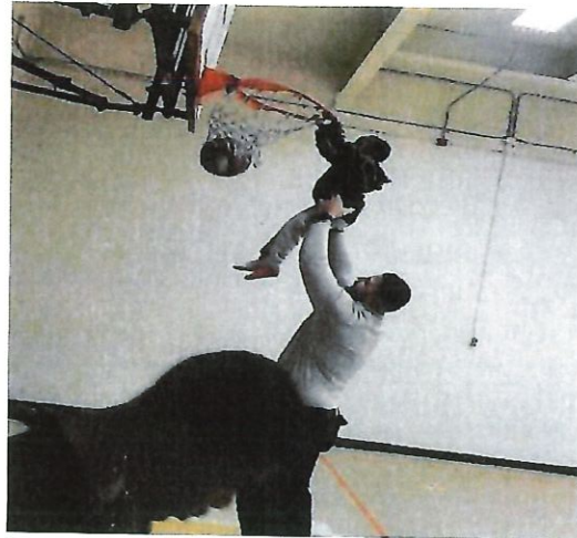
PHA Officers interacting with children and youth at Open Gym events at the Chad Brown and Manton Heights family developments.