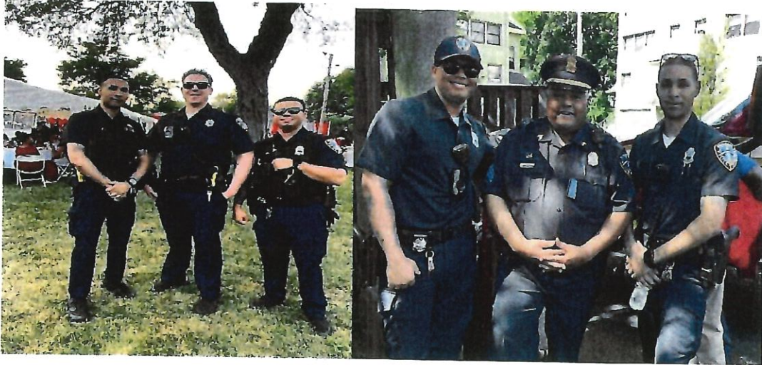
A PHU Officer at Get Connected event at Chad Brown and Harford Park