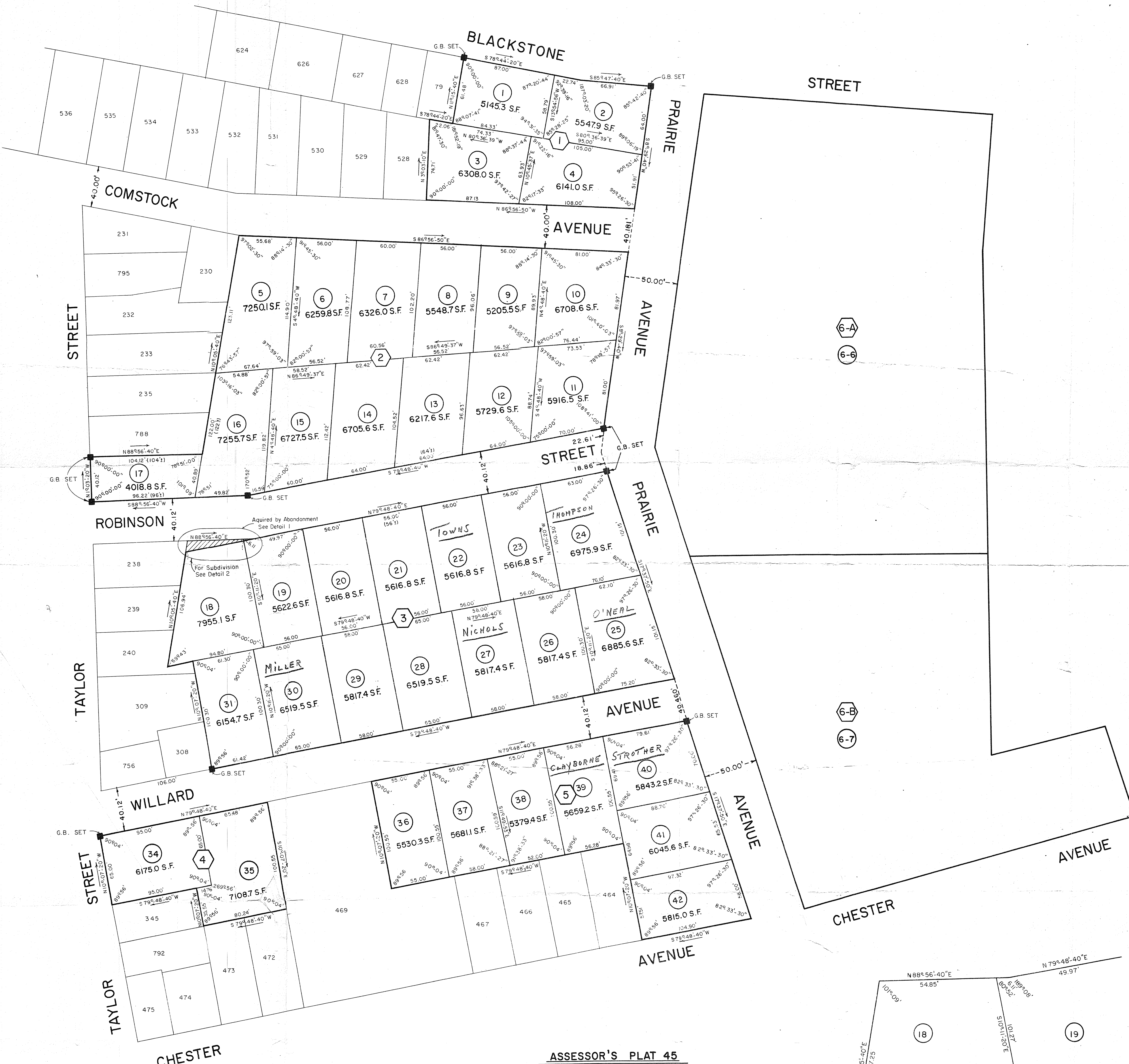
ASSESSOR'S PLAT 45