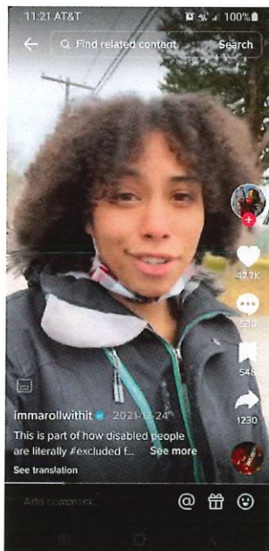
Pedestrian Dignity on TikTok, also available on Instagram https://www.tiktok.com/t/ZTRWmvmab/

Expect some suburban & urban landscapes with a hip-hop soundtrack.